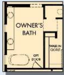
OPTIONAL FREE STANING TUB AT OWNER'S BATH