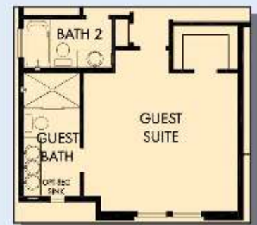
OPTIONAL GUEST SUITE WITH GUEST BATH AT BEDROOM 2 AND 3