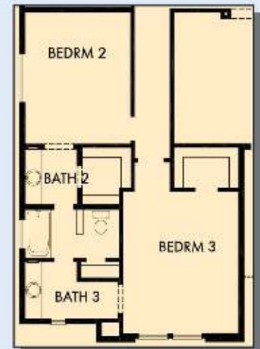
OPTIONAL EXTENDED BEDROOM 2 AND 3 WITH BATH 2 AND 3 AT RETREAT