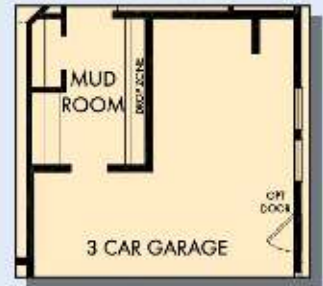
OPTIONAL MUD ROOM WITH 3 CAR GARAGE