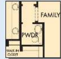
OPTIONAL AT FAMILY POWDER BATH