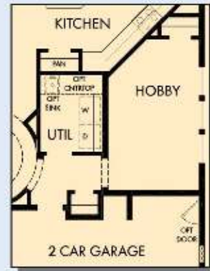
OPTIONAL HOBBY AT GARAGE