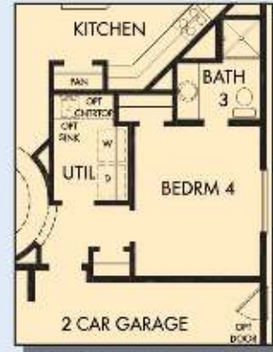
OPTIONAL BEDROOM 4 AND BATH 3 AT GARAGE