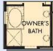
OPTIONAL SEPARATE TUB AND SHOWER AT OWNER'S BATH