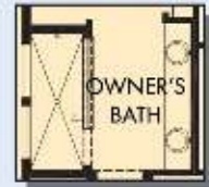
OPTIONAL SUPER SHOWER AT OWNER'S BATH