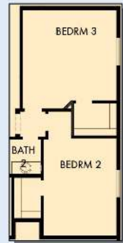
OPTIONAL EXTENDED BEDROOM 2 AND 3