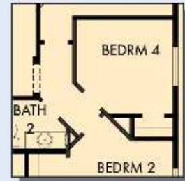
OPTIONAL BEDROOM 4 AT RETREAT