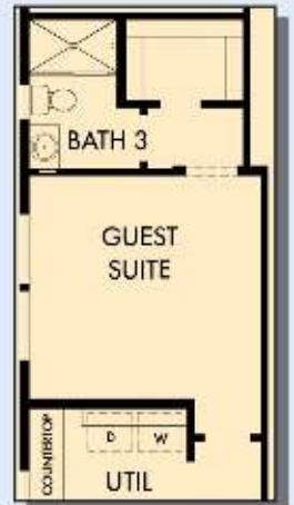
OPTIONAL GUEST SUITE WITH BATH 3 AT STUDY