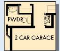
OPTIONAL POWDER BATH AT HALL WAY